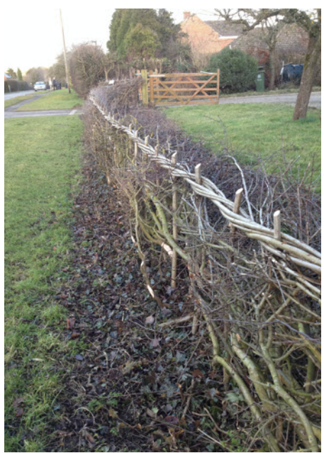
Three lovely new examples of hedge laying gardens in Oxhill.

"March is the first day of Spring. He is Nature's Old Forester, going through the woods and dotting the trees with green, to mark out the spots where the future leaves are to be hung. The sun throws a golden glory over the eastern hills, as the village-clock from the ivy-covered tower toll six, gilding the hands and the figures that were scarcely visible two hours later a few weeks ago. The streams now hurry along with a rapid motion, as if they...were eager to rush along the green meadow-lands, to tell the flowers it is time to awaken."