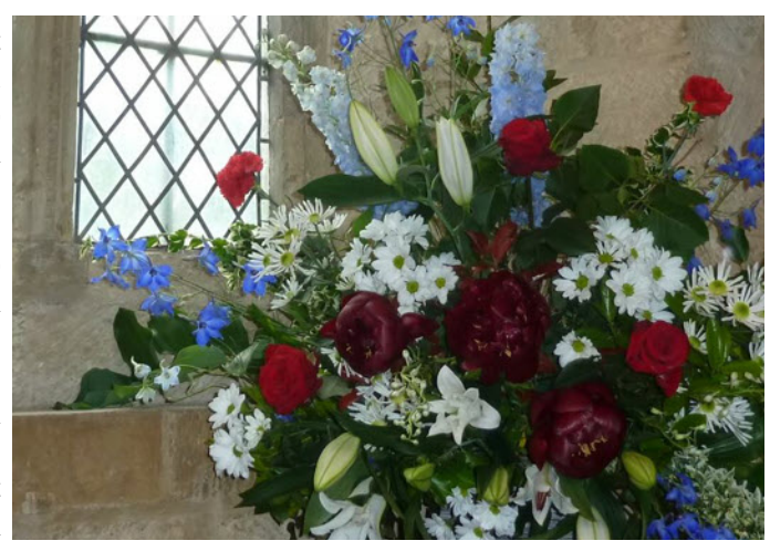
Beautiful flower arrangement in the church during the Jubilee in 2012

Flowers can be from your garden or a shop-and you really do not have to be an experienced flower arranger!